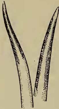
FIG. 3.— Eutyphoeus orientalis ; penial setae: \times 300 .

The spermathecae are somewhat ovoid sacs; the duct is very short and stout, from the under surface of the ampulla; the margin of the ampulla is crenated. The diverticula are two, attached to the beginning of the duct and rather on its posterior side; they appear to have one, two, or three small chambers.